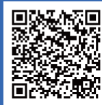
[List of Participating Shops] Extension of business hours

* For the duration of the event from May 26 (Sat) 10:00 to May 27 (Sun) 18:00, special services will be available to visitors who have this guidebook.