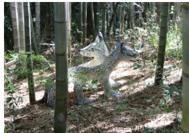
《Wolf Bench》, 2022