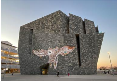
《Musashino BLACK KITE》, 2021, Collection of Kadokawa Culture Promotion Foundation