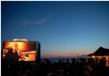
ZUSHI BEACH FILM FESTIVAL