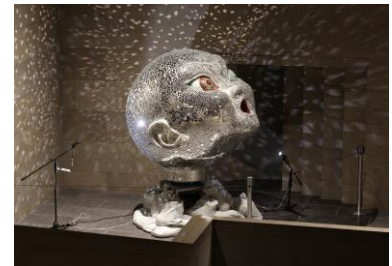
《Earth Baby》, 2009